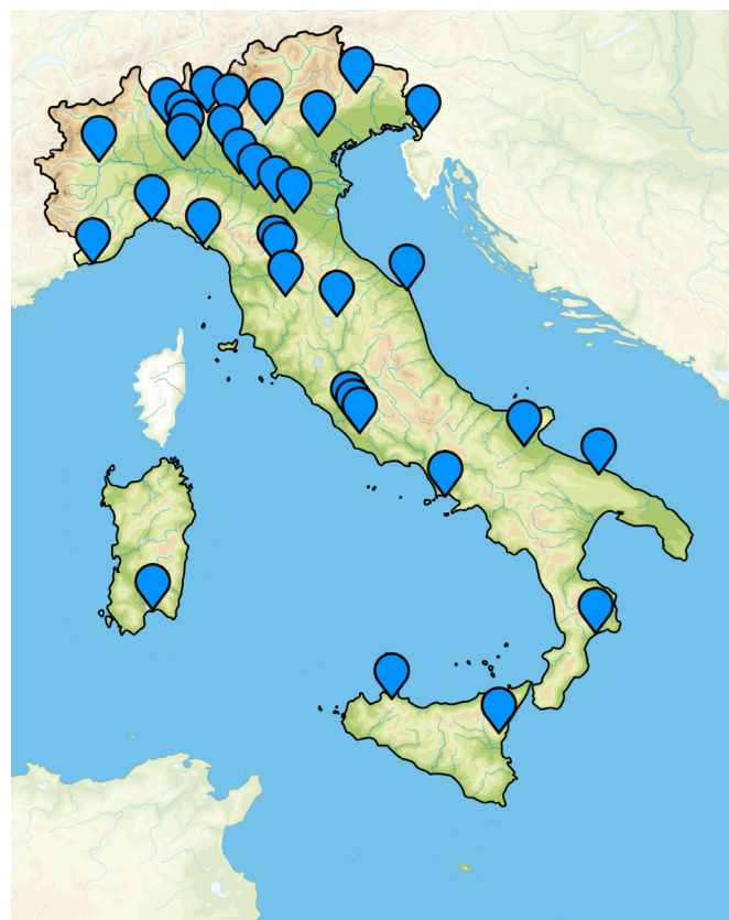
Figure 2 The 39 infectious diseases clinics participating in the PRESTIGIO Registry located throughout Italy.

The principal investigator is responsible for coordinating all the activities of the registry within the coordinating and the participating centres. The steering committee of the registry is responsible for (1) overseeing