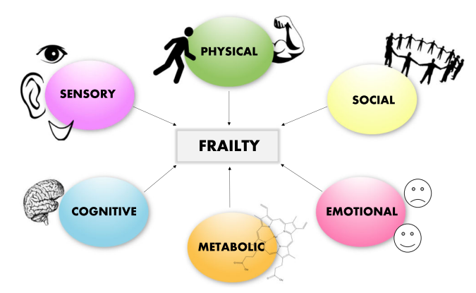
Fig. 2 The faces of frailty

At midlife, we operationalized the FFI similarly to the Multicenter AIDS Cohort Study (MACS), which is composed of HIV+ and HIV- men [15]. The WIHS Core battery provided FFI, HIV status, and constellations of variables representing demographic/health behaviors and aging-related chronic diseases. With an age range of 50-64 years, MACS observed 12% frailty prevalence among HIV+ and 9% among HIV- men [20]. In contrast, using similar criteria in the WIHS, the overall frailty prevalence was 15% (HIV+, 17%; HIV-, 10%) among women at midlife. A stepwise multivariable model suggested that HIV infection with CD4 count <200; age >40 years; current or former smoking; income ≤$12,000; moderate vs low FIB-4 levels; and moderate vs high eGFR were positively associated with FFI. Low or moderate drinking was protective. Typical aging-related co-morbidities such as obesity, type 2 diabetes, cardiovascular disease, and hypertension, as well as recreational drug use and self-reported or historically measured co-infections were not significantly associated with frailty in the final multivariate model. These results show that frailty is a multidimensional aging phenotype observed even in midlife among women with HIV infection; suggest that the frailty constellation may change with age; and show that prevalence of frailty in HIV-infected WIHS women exceeds that for usual elderly populations.